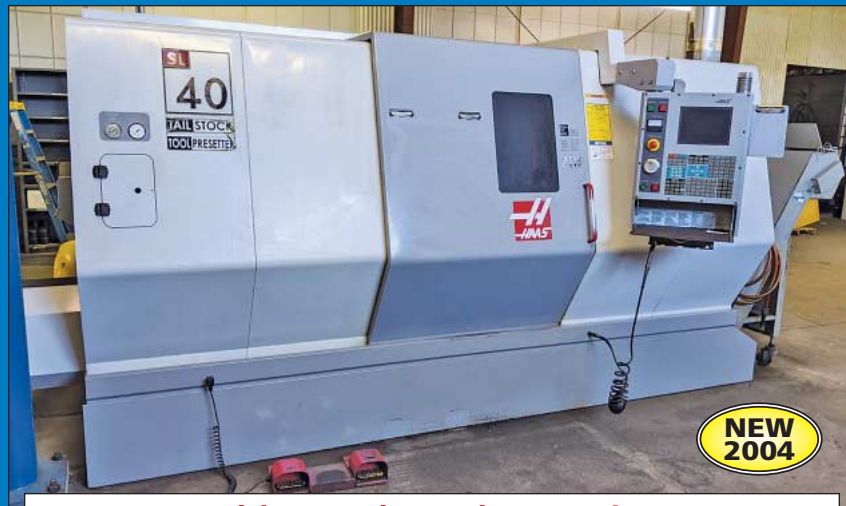
Haas Model SL-40T Slant Bed CNC Turning Center

auctioneers | appraisers | since 1961 | cia-auction.com | info@cia-auction.com 2020 Dunlap St., Cincinnati, Ohio 45214 Phone 513-241-9701 Fax 513-241-6760